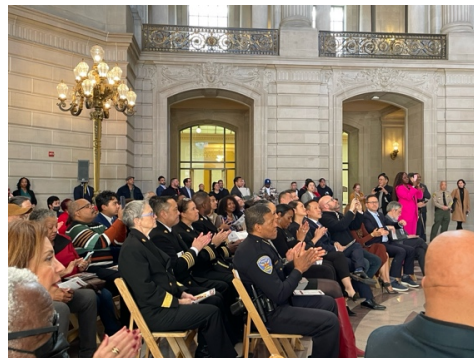
LEFT: Partial view of audience; View of audience applauding