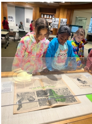
Young students view display of 1972 Afrikan Liberation Day materials at SF Public Library, African American Ctr.

Get involved. Contact us at: info@sfaahcs.org