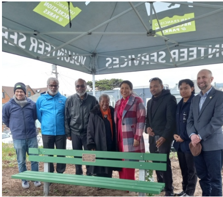
PHOTO ALBUM – PHOTO ALBUM -- PHOTO ALBUM – PHOTO ALBUM -- PHOTO ALBUM – PHOTO ALBUM